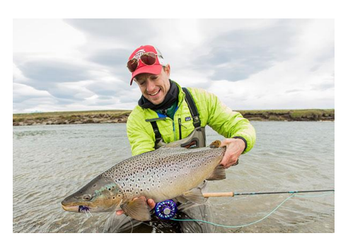
Typical brown trout on the Rio Grande range from 12 to 20 pounds

I lumped Kamchatka and New Zealand into two huge geographic regions as because within them, there are so many fine rivers of comparable quality that it's hard to pick out just one river. However, in Argentina there is one river that's obviously exceptional. The Rio Grande on the island of Tierra del Fuego is no ordinary trout stream. Sheep ranchers in the late 1930s stocked German brown trout in tributaries of the Rio Grande, but they never dreamed that some of them might make it to the ocean to feed, and that many decades later, it would develop into the world's finest river for sea-run brown trout. When Outdoor Life writer Joe Brooks first visited the river in the 1950s, he wrote of catching two of these sea-runs, one was 18 pounds which at the time was unheard of.