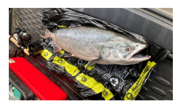
The salmon, caught off Pauls Rd, weighed 6.35 kilograms

"The salmon had just come from the sea, where there are silver-coloured herrings and other bait fish, which it would have fed on.