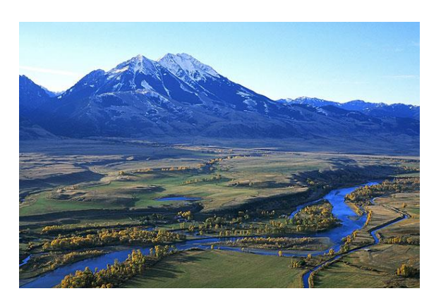
The Yellowstone River is the longest free-flowing, undammed river in the contiguous United States, and the third-longest in the world

There is great fishing through all of our Rocky Mountain states, but one thing separates Montana from all others: Article IX, section 3 of the 1972 Montana Constitution gives the streambeds in that state to the public for recreational use.