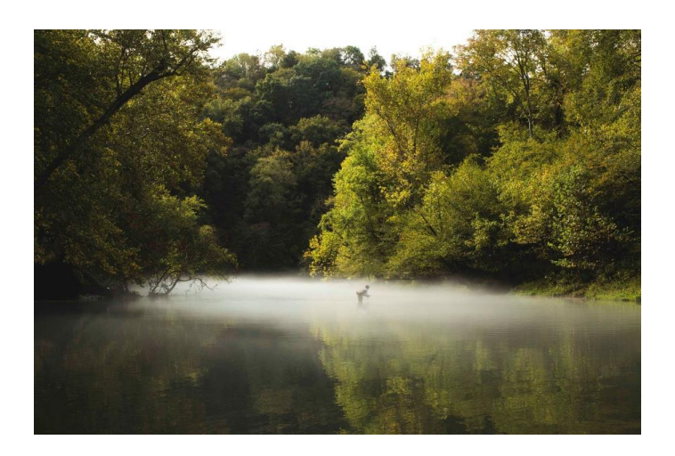
If no one's swinging, it's probably because you're not throwing strikes.

The great Ted Williams once watched three pitches go by without offering the slightest evidence of a swing. The umpire yelled "ball" each time, and—upset with those calls—the young catcher behind the plate turned and complained.