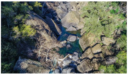
Fish ladder and rock fall barrier Big Chico

Crowfoot took up the cause, launching Cutting the Green Tape, an initiative to accelerate ecological restoration across the state.