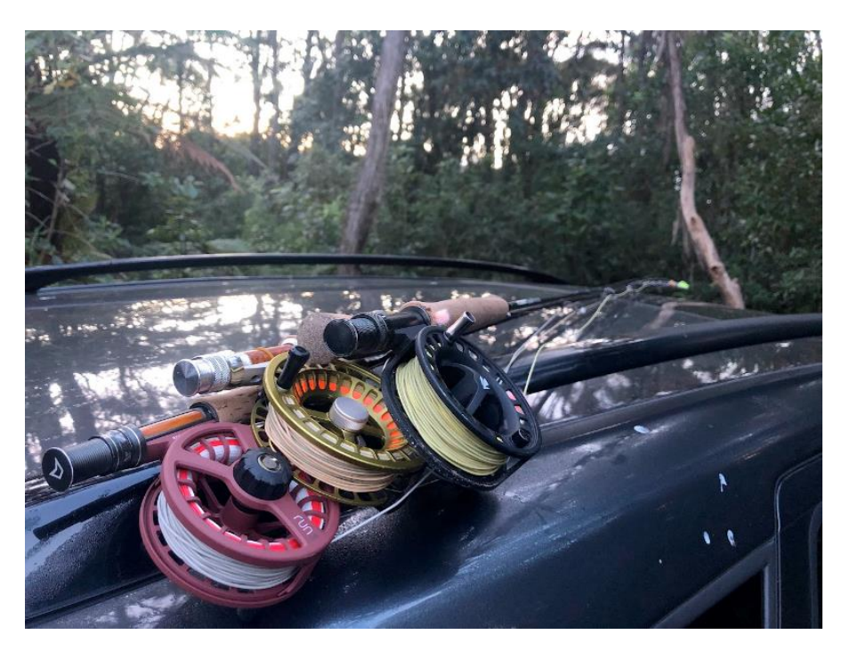
Kapiti Fly Fishing Club June 2023 Newsletter