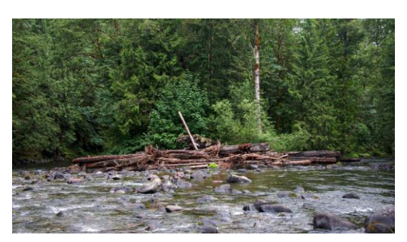
Logiam on the Salmon River in Oregon

An unconventional gathering helped spur ideas to speed the pace and scale of river restoration projects across the West Coast.