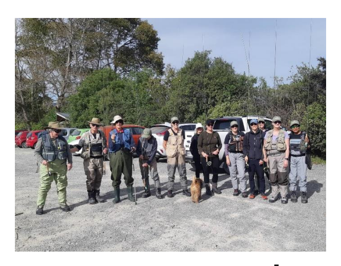
A Women on The Fly gathering next to the Ōtaki River

She said if women were keen to get involved, they could check out www.womenonthefly.co.nz.